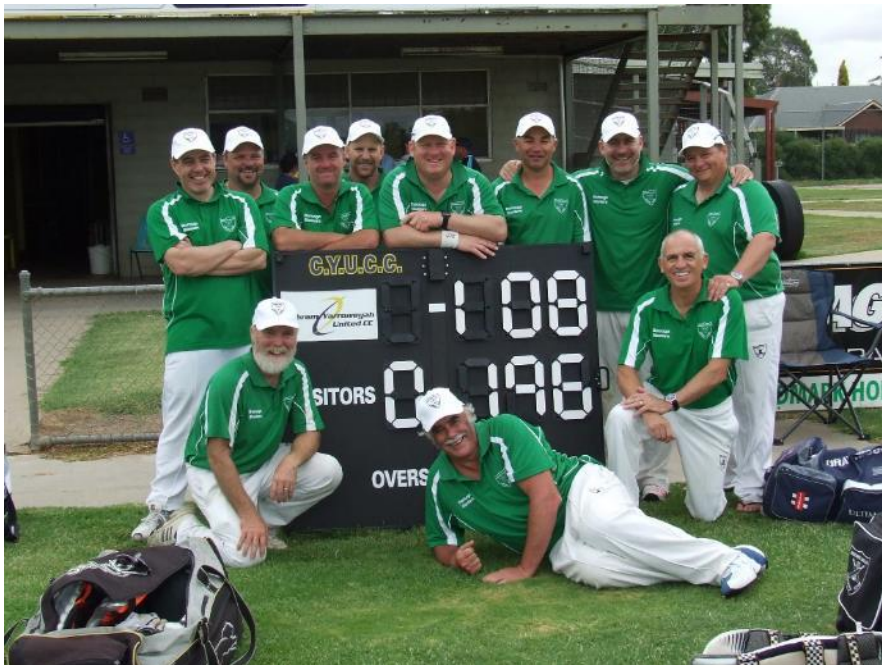
Above: Our Barooga representative team after a win.